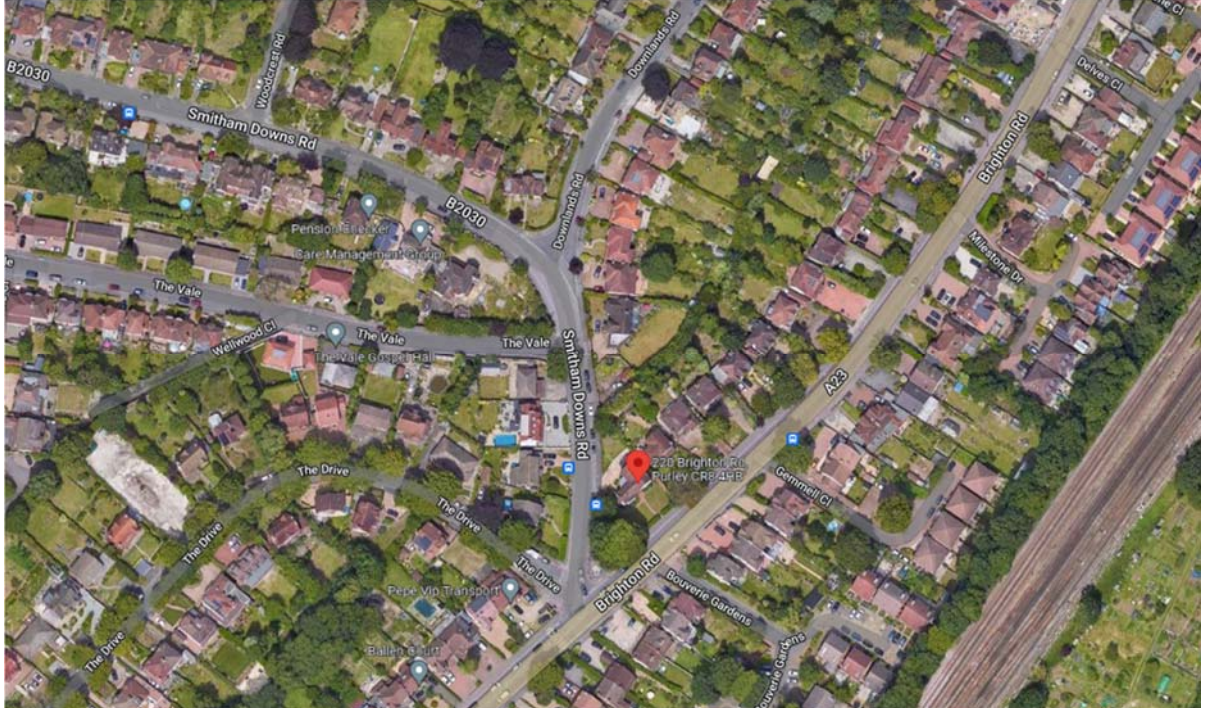
Figure 3 – Google maps view of site