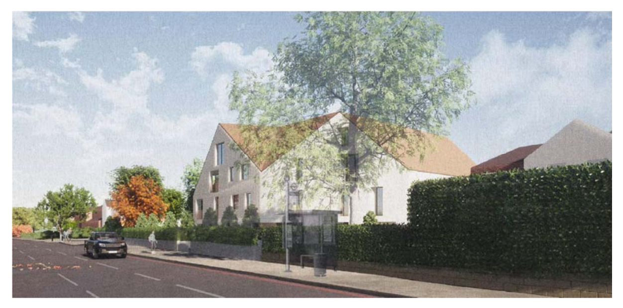
Figure 1 - CGI of front of proposal (from Brighton Road)