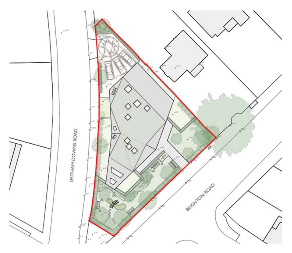
Figure 4 - Proposed site plan

8.15 The Local Plan requires all flatted development to provide new child play space on top of the amenity space to be provided for the scheme itself. As mentioned, child play space is proposed in the southern part of the site. With a combined communal amenity/playspace of 157 sqm this would allow for compliance with the 19.2 sqm requirement detailed in Table 6.2 of the Local Plan.