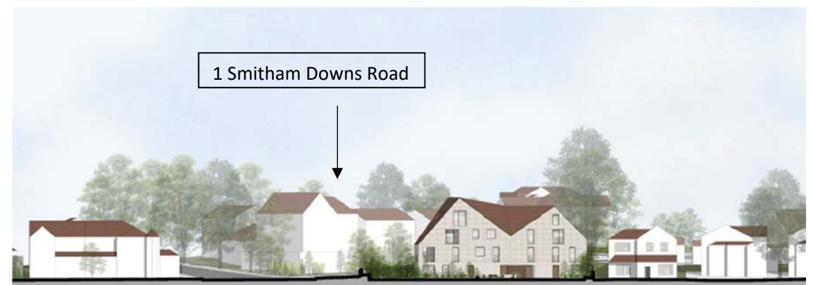
Figure 5 - Proposed Brighton Road street scene

8.18 The proposed ridge line still sits below that on the adjacent development under construction at 1 Smitham Downs Road (see Figure 5), with the eaves closest to 218 Brighton Road matching those on the neighbouring property. Considering the varying heights in the vicinity, the proposed is still respectful of the surroundings.