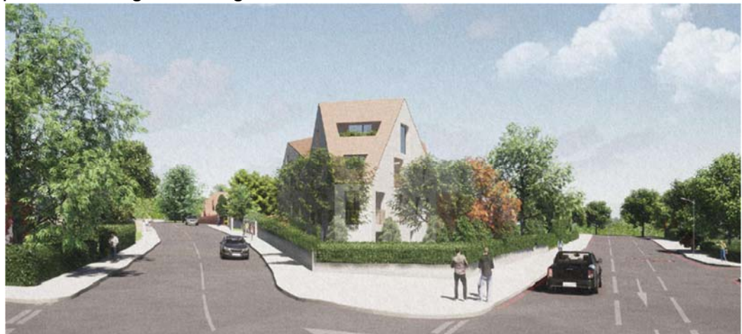
Figure 5 - View from Brighton Road/Smitham Downs Road junction

8.19 The apex of the proposed building is in the southern corner of the plot, where the building footprint angles out. This creates an architectural feature which addresses the junction and allows the frontage to be viewed from all directions. The design also gives the impression that the width of the building is divided into two smaller sections, mimicking the other larger semi-detached pairs which appear as a single building.